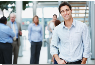
24X7 Hosted Technical Support